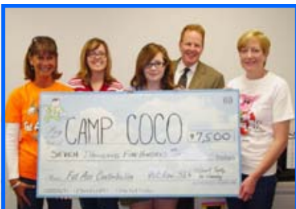
Organizers of the Fat Ass 5K & Street Party for Charity gifted Camp COCO $7,500. We are grateful to benefit from this popular race held annually in downtown Springfield.