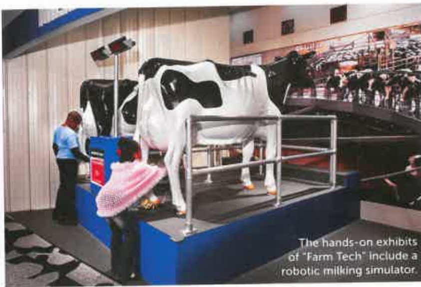
The hands-on exhibits of "Farm Tech" include a robotic milking simulator.

It took more than five years to bring the exhibit to fruition, but MSI officially opened "The Farm" in 2000.