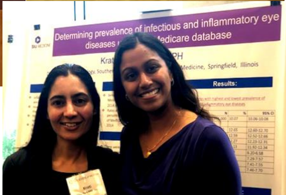
Speakers & guests at the 2019 Professional Development Conference