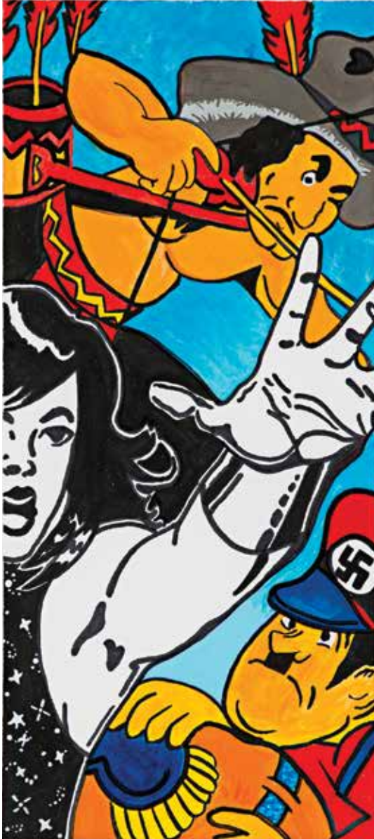
Lacey Wood, student