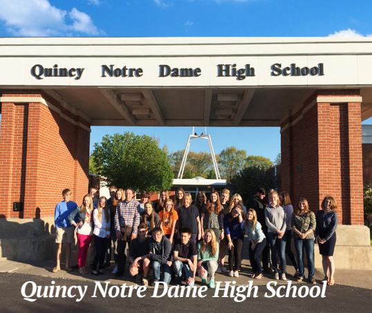
Quincy Notre Dame High School

Learn more about Quincy's outstanding schools and colleges