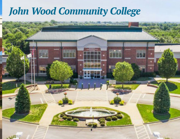
John Wood Community College