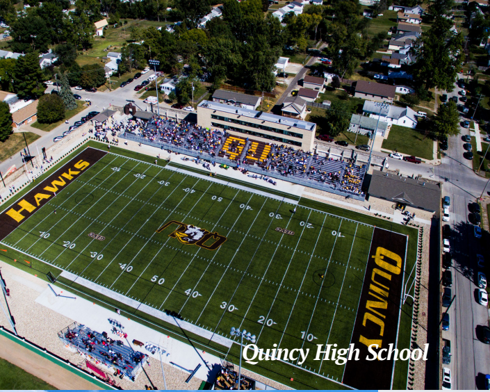
Quincy High School