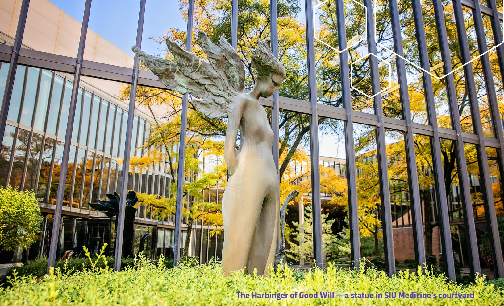
The Harbinger of Good Will — a statue in SIU Medicine's courtyard