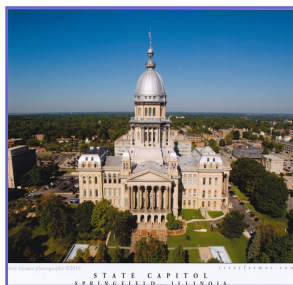
STATE CAPITOL SPRINGFIELD, ILLINOIS