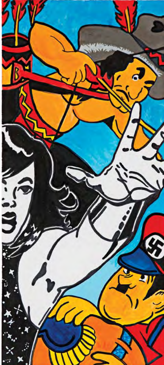
Lacey Wood, student