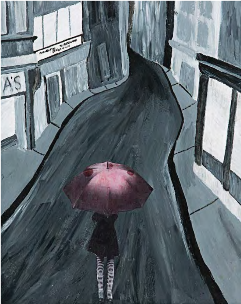
Emma Sandstrom, community

YOU ALWAYS TAKE THE WEATHER WITH YOU , acrylic paint & paper