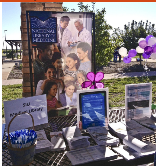
Library exhibit at Southwind park for the Walk to End Alzheimers

Library faculty continue outreach efforts at both local community events and professional meetings. Recent events include: