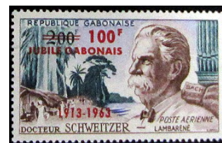
Stamp celebrating Dr. Albert Schweitzer

Class descriptions may be found at http://www.siumed.edu/lib/libclasses.html