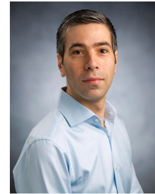
ID Badge Photo